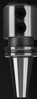
SK SLIM CHUCK