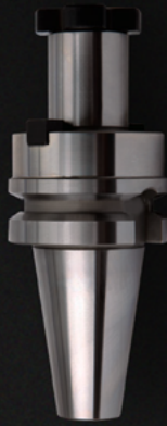
END MILL HOLDER