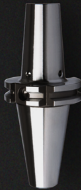
POWER MILLING CHUCK