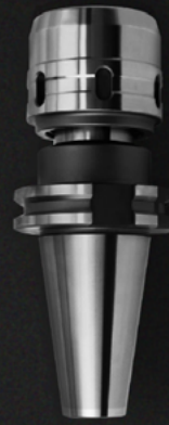
TAPPING ER CHUCK